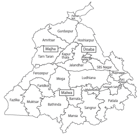
Figure 1. Map of Punjab

diversification, agricultural inputs, market systems, monitoring systems, penalties for farmers, sowing dates, straw use (ex-situ management), government subsidies (in-situ management), farmers' movements, weather conditions, the impact of diseases, the impact of COVID-19, and stubble burning in Haryana. Summaries of key events in each category are presented in the following sections.